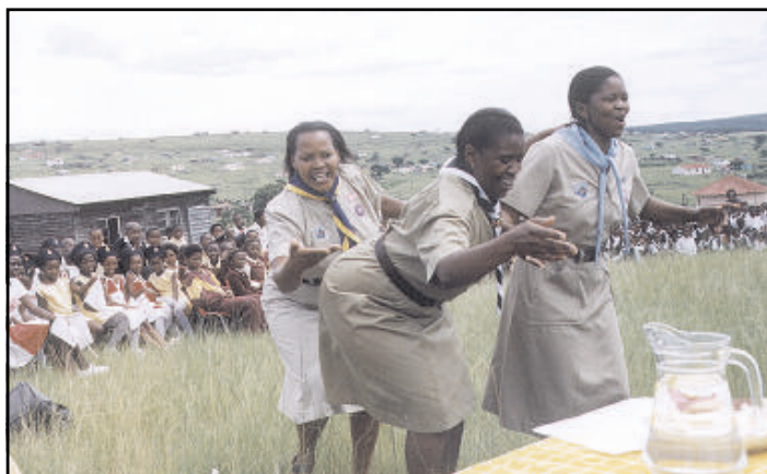
SCOUTERS DOING A TRADITIONAL SONG & DANCE.

KIWIT - Inspired by "First Aid Achievements - 1982"